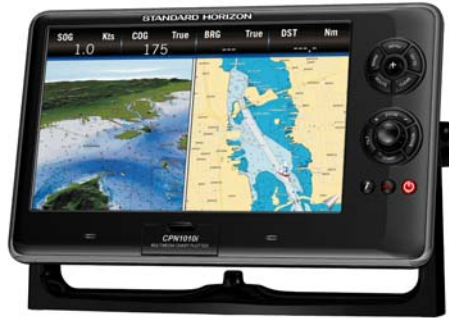
CPN1010i MAP $2299.99