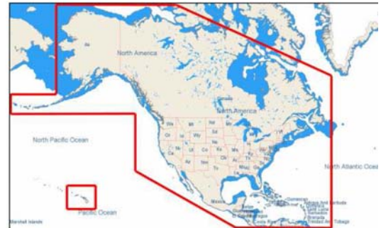
Built-in charts of USA including Alaska, Hawaii and Great Lakes, Canada, Bahamas, Caribbean, Cuba, Mexico, Puerto Rico, and Central America