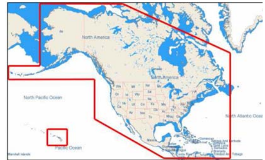
Built-in charts of USA including Alaska, Hawaii and Great Lakes, Canada, Bahamas, Caribbean, Cuba, Mexico, Puerto Rico, and Central America