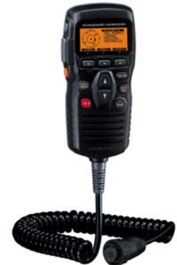
Optional RAM3 with AIS display