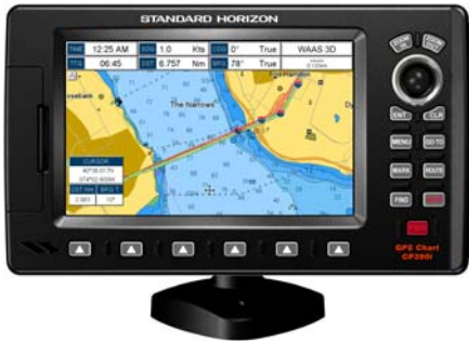
CP390i – MAP $999.99