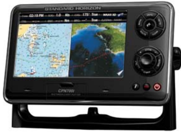
CPN700i MAP $1499.99