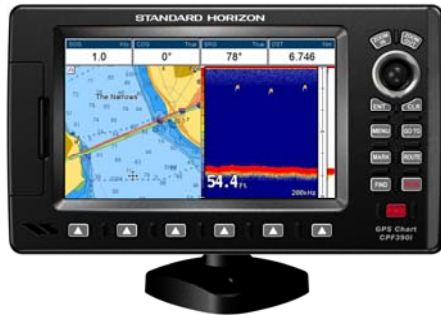
CPF390i MAP $1099.99