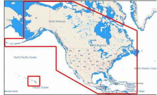
Built-in chart of USA including Alaska, Hawaii and Great Lakes, Canada, Bahamas, Caribbean, Cuba, Mexico, Puerto Rico, and Central America