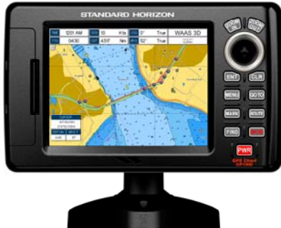
CP190i MAP $599.99